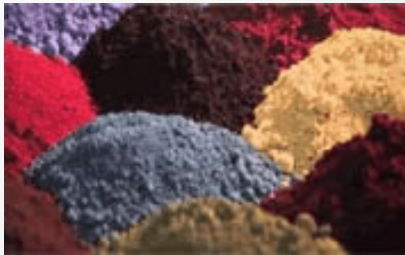
Alabama Pigments Company, LLC

Integral coloring admixtures are typically a blend of synthetic or natural iron oxide pigments and surfactants (or wetting agents) that are mixed thoroughly into fresh concrete before placement to achieve uniform, homogeneous color. Integral colors are available in powdered, granular, or liquid forms. For convenience, contractors can order the color directly from the ready-mix supplier for addition at the batch plant. However, many manufacturers have made it easier than ever for contractors to add the color to the truck mixer at the jobsite by packaging their dry pigments in premeasured quantities in disintegrating bags that can simply be tossed unopened directly into the mixer. Liquid pigments, which typically come in pails or buckets, are also easy to add onsite to the concrete mix.