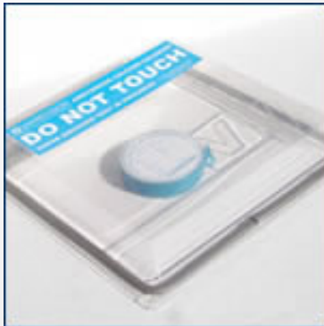
A Calcium Chloride Test is a good surface moisture test for determining the current vapor transmission rate of concrete.

Even if some answers are provided it behooves the contractor to do some independent fact finding to determine the current vapor transmission rate (VTR). Probably the oldest test method is the Plastic Sheet Test (ASTM-D-4263) which is taping down a clear 18" X 18" sheet of poly and checking 16 hours later for condensation or for a darkened concrete surface. Both are indications of vapor transmission. Another surface moisture test is The Calcium Chloride Test which quantifies the rate of vapor transmission. This is a covered dish that is weighed before and after a twenty four hour period. Both are cost effective measures in determining whether vapor is active.