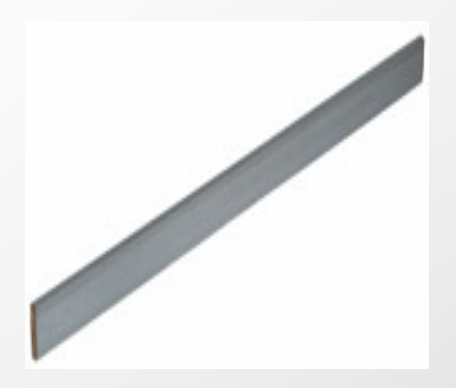
Straightedge.