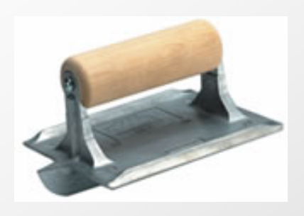
Groover. Photo courtesy of Marshalltown.

What's available: Groovers are usually made of bronze or stainless steel and have a V-shaped bit that cuts the groove. Like edgers, they come with wood or comfort-grip handles. The most common groover size is 6 inches long and 4 1/2 inches wide, but many other sizes are available, ranging from 2 to 8 inches wide and 3 to 10 inches long. However, more important is the dimension of the bit, which can be anywhere from 1/2 inch to 2 inches deep and 1/8 to 1 inch wide. Bi-directional groovers are also available and have double-end bits that give you the flexibility to cut forward or backward.