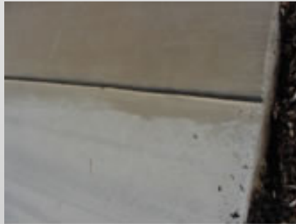
Close-up of curing differences.