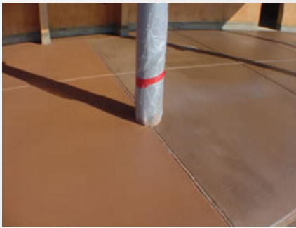
Changing cements mid-job will result in a color difference.

If the surface is drying out, or the weather is hot and windy, don't use water! Instead, use a surface evaporative control agent. Available at most concrete distributors, these surface evaporative control chemicals are a must for anyone placing any type of decorative concrete. While all of these surface evaporative chemicals slow the hydration of concrete in hot windy conditions, some are even designed to help finish wetting out color hardeners if the concrete is drying out too fast.