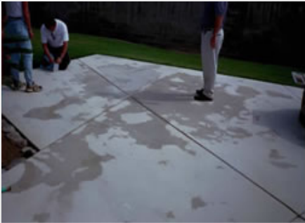
Inconsistent cure produces inconsistent color which is much more noticeable in colored concrete versus gray concrete.

Those same slight color differences can more often than not hold up your payment or even result in concrete removal and re-pour. To help avoid this potential problem, the use of a matching colored curing compound or colorwax is always recommended when pouring colored concrete.