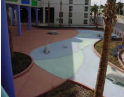
Controlling all the variables can produce large, integrally colored concrete projects.