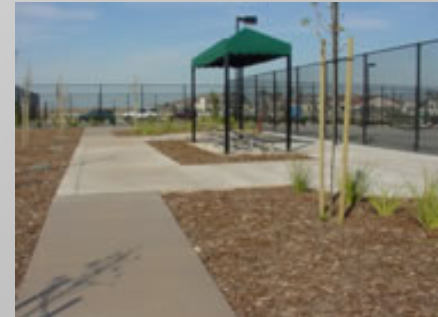
Half the project was cured with a colored curing compound; the other half was not.